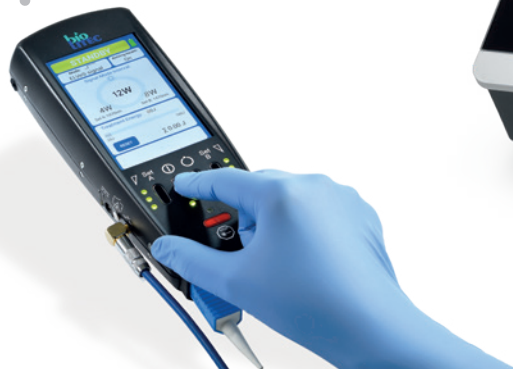
LEONARDO® Mini basic & specialist