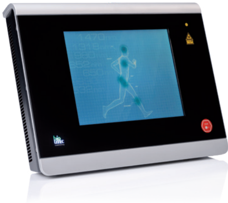
LEONARDO® DUAL 45 universal & ingenious