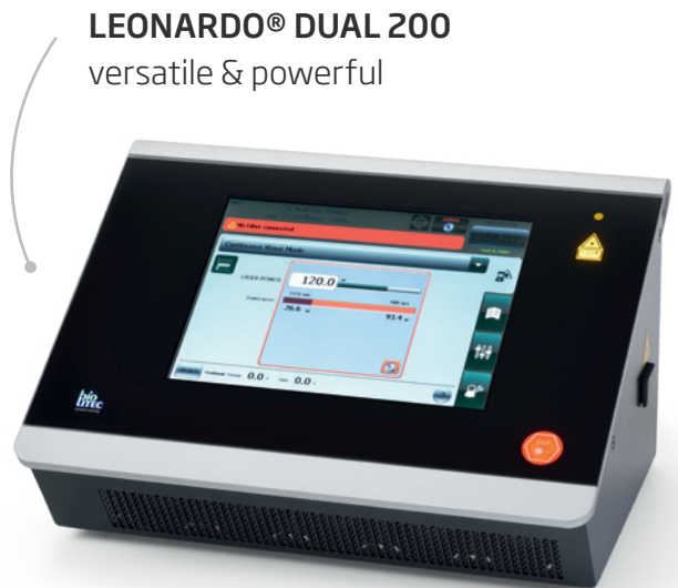
LEONARDO® DUAL 200 versatile & powerful